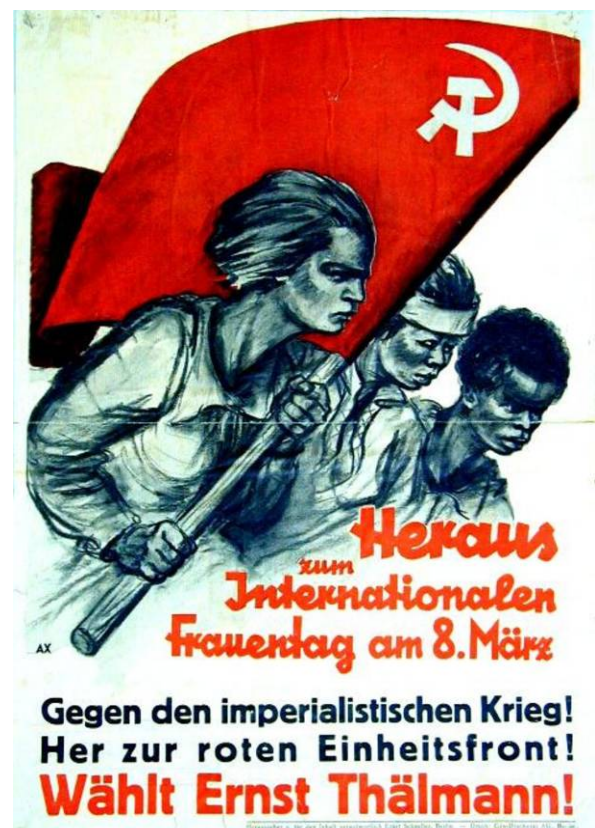
German Posters for International Women's Day, 1913 and 1932